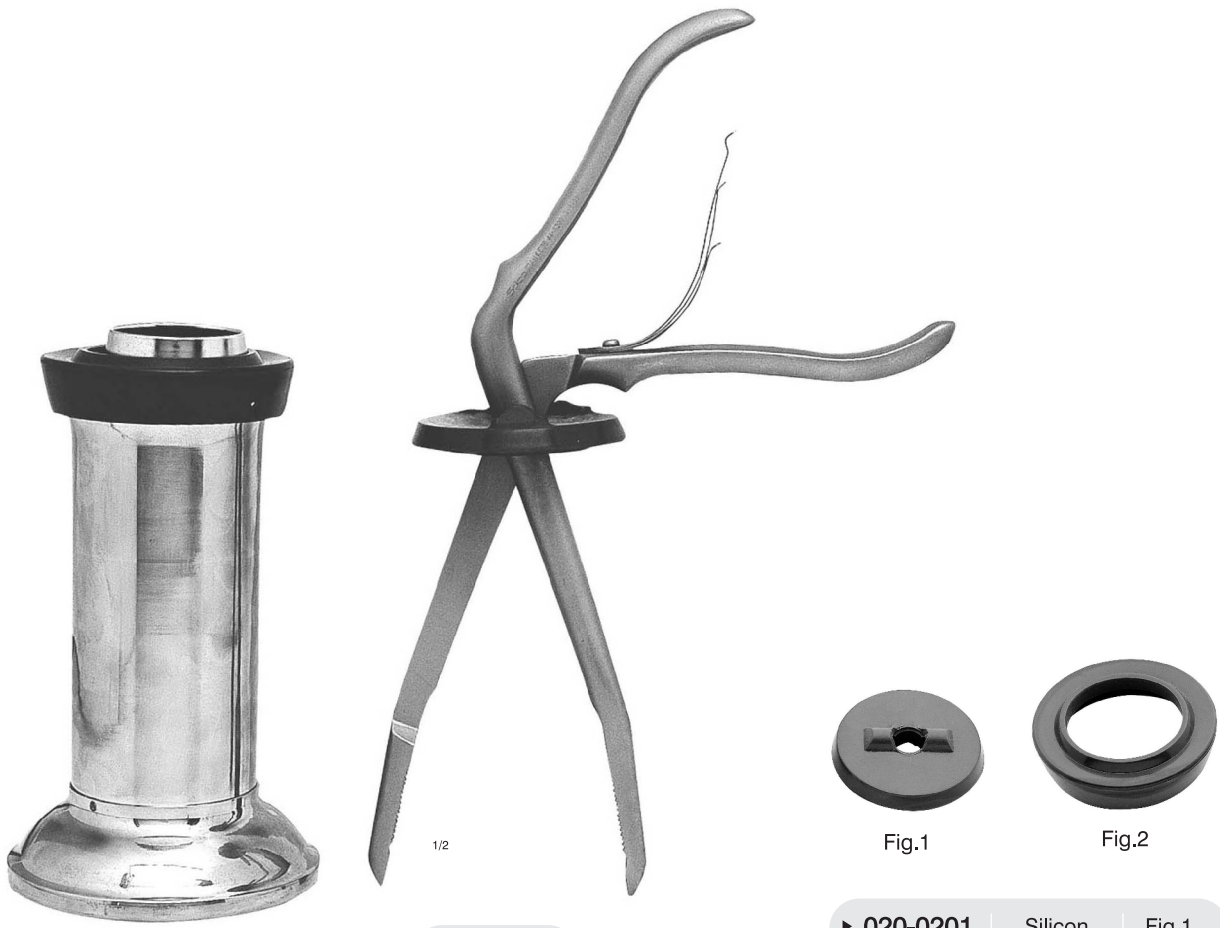
TRANS FORCEPS JAR SET