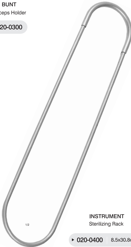
INSTRUMENT Sterilizing Rack